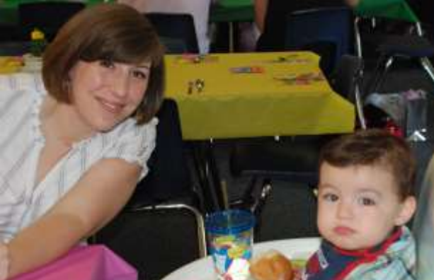
There is nothing like the love of a Mom and her children