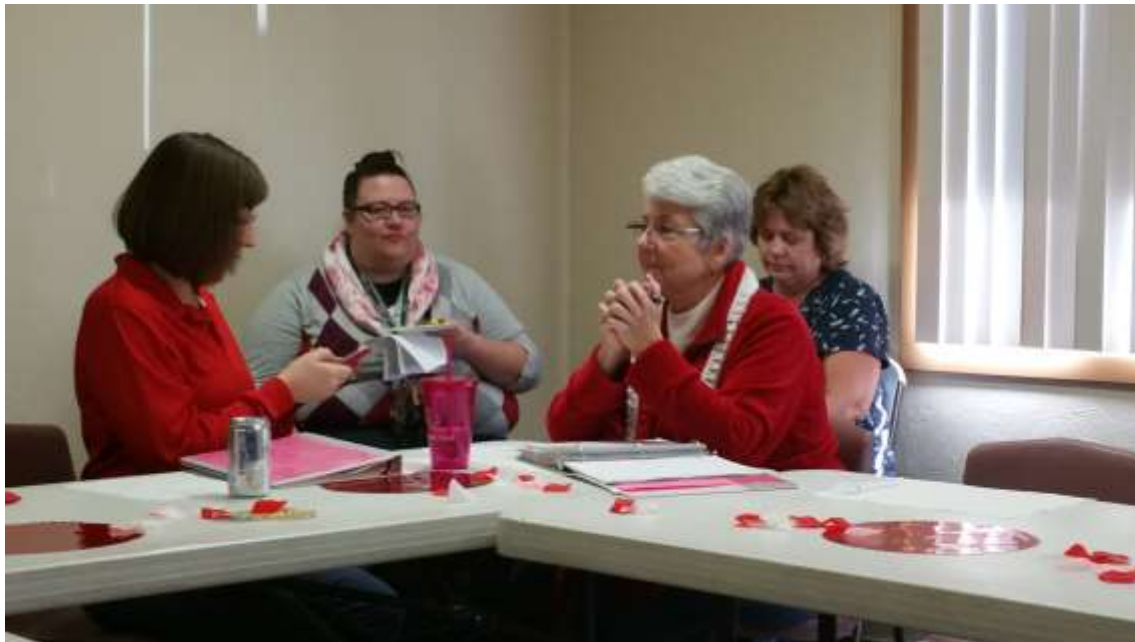
Sharing the modern way—on cell phones!