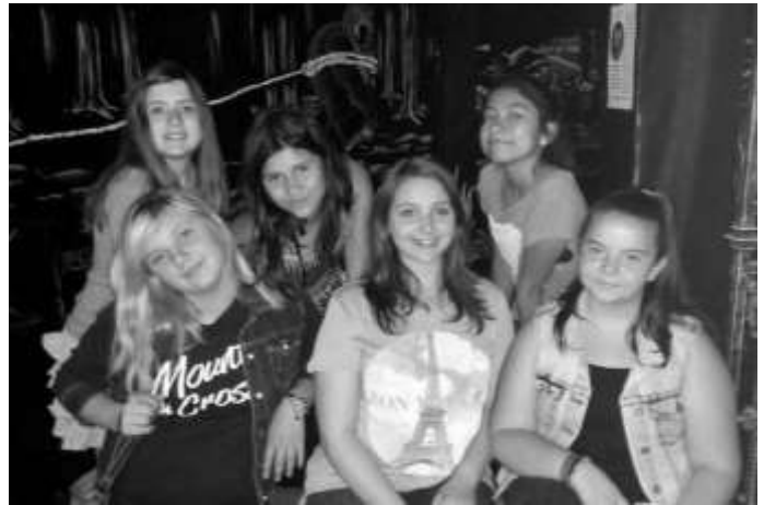
St. Luke's Youth—Monster Mini-Golfing