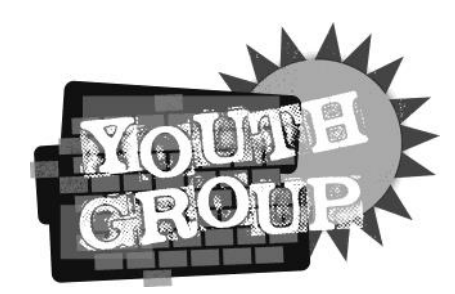
ST. LUKE'S YOUTH

A huge thanks to the congregation members who contributed to the crab feed bake sale, and to the members of the SLY group who helped us sell an amazing amount of beverages and delicious desserts!