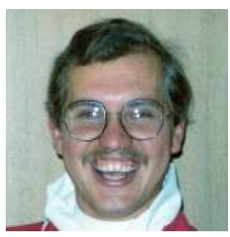
Ordination Day 1977

Concerning the teachings of Jesus—Jesus made one point over and over again most emphatically—the things He declared and taught were not in any way opposed to the ancient beliefs and teachings of Israel. It was the religious authorities of His time that