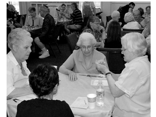
BUNCO A BIG SUCCESS...AS USUAL!!!