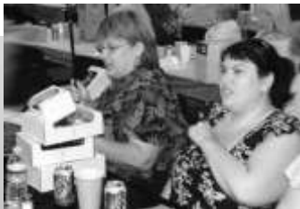
One of many raffle prize winners!