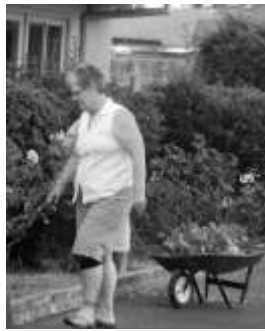
Pruning the "Kiser Rose Garden"