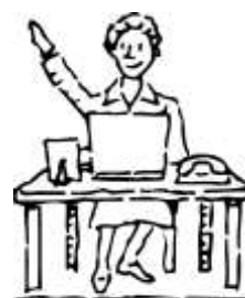
It's Been Great!