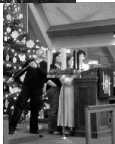
Our Annual Congregational Meeting & Potluck was a great success!