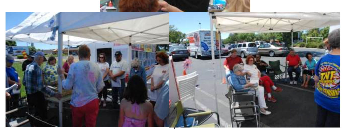
Our Fireworks Booth is about so much more than just a fundraiser.