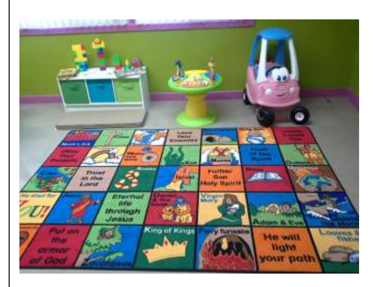
Pre-School Room and Children's Clothing Exchange