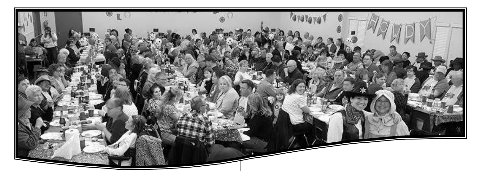
Crab Feed 2016