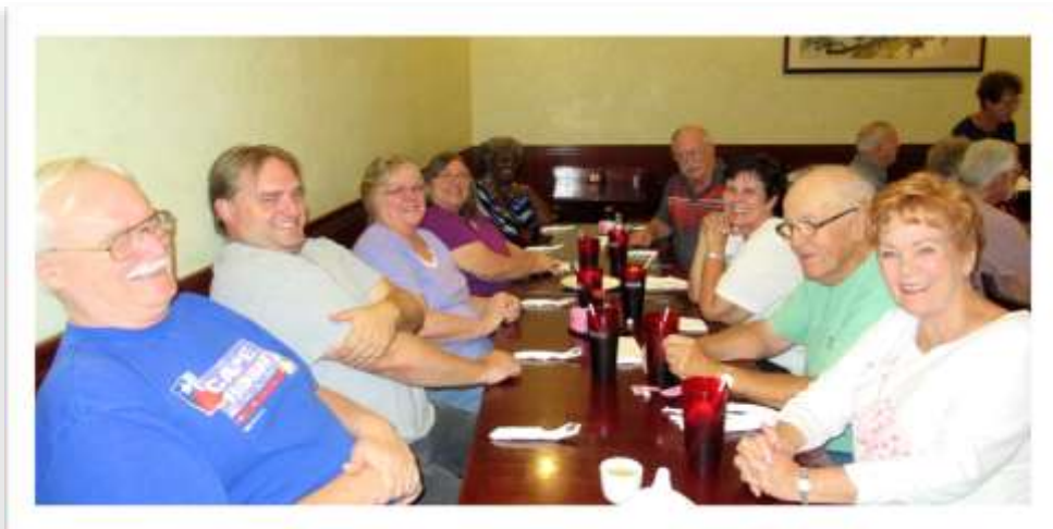
Fellowship Meal at #1 Buffet