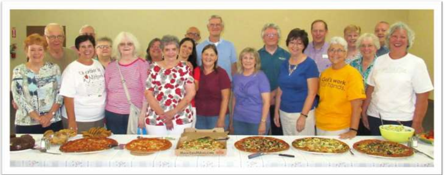
Family Potluck & Study