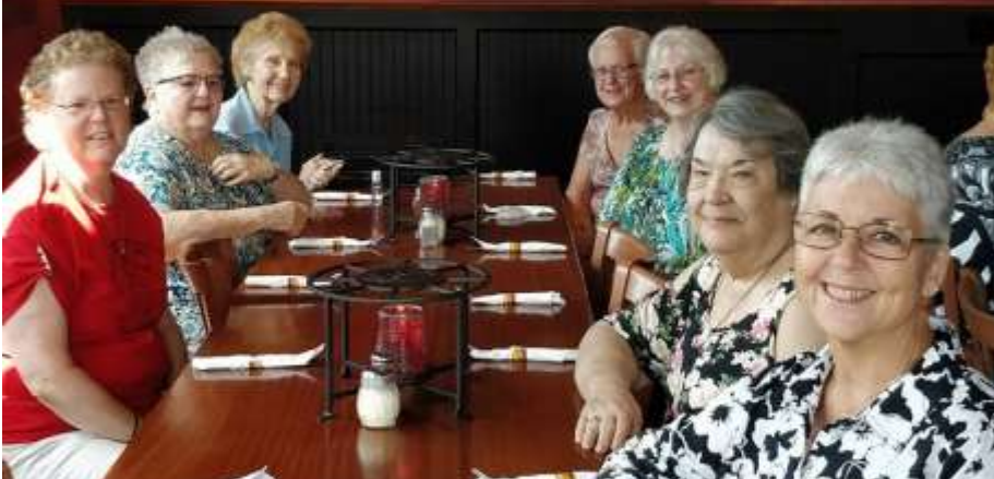
Lunch at Chicago Fire with WELCA

We are beginning our preparations for the end of the year events, specifically our Christmas collection to support families from Charles Mack Elementary School. Look for more information in upcoming issues.