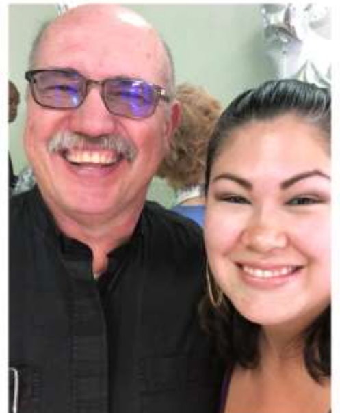
Congregational Picnic and Pastor Ca