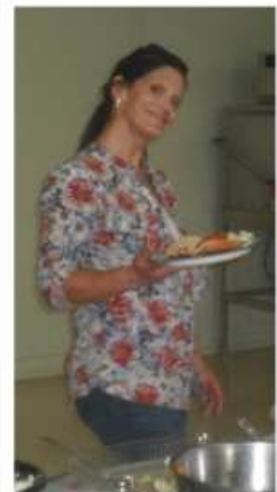
arl celebrating 25 years at St. Luke's