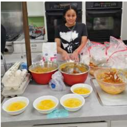
Pumpkin Bread Making