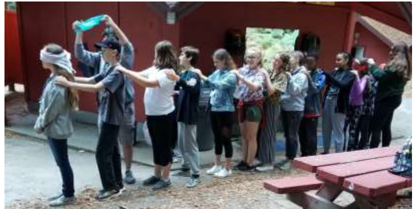
Mount Cross Retreat