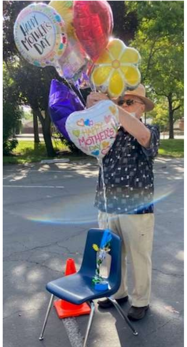
Mother's Day Drive Thru W-ELCA provided flowers to all the women who came.

Join us for Drive through Prayer! We are in the church parking lot from 9:30 a.m. to 11:00 a.m. every Sunday.