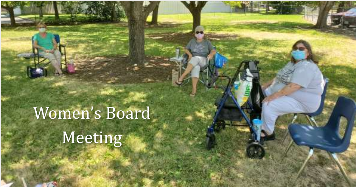
Women's Board Meeting