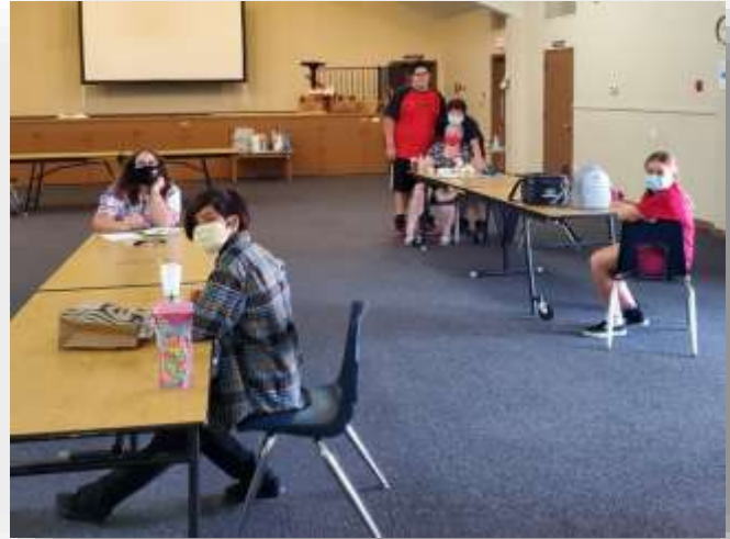
Youth Meeting August 2020